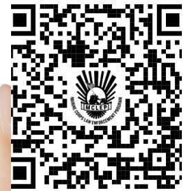
HQ MCLEP Recruitment

PNDL_PMO_CommunityOrientedPolicing@usmc.mil