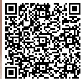
Lost & Found