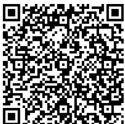
Mass Notification Register