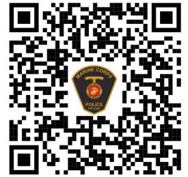
Camp Pendleton MCLEP Recruitment

Contact Information: Provost Marshal Office Building 4100377 Marine Corps Base Camp Pendleton, CA NON-EMERGENCY DISPATCH: 760-725-3888 PMO Desk Sergeant: 760-725-9883